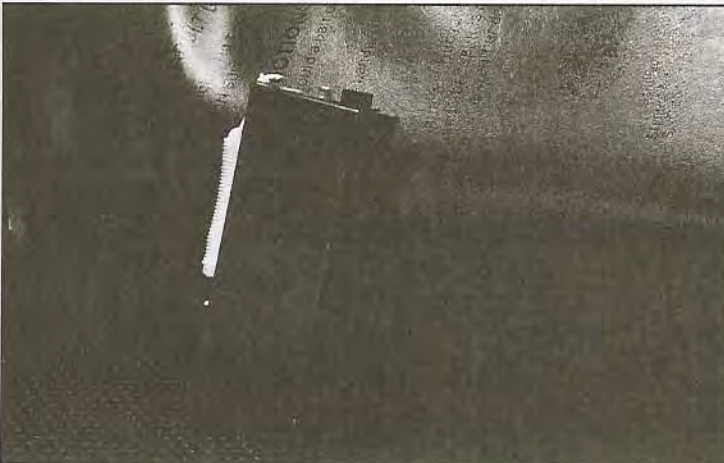
ACR RLB-21 CLASS B EPIRB

U.S. Coast Guard Approved. Complies with SOLAS 74/83.