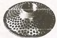
SKIMMER TOP ROUND HOLE TYPE *