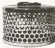
304 STAINLESS STEEL ROUND HOLE TYPE