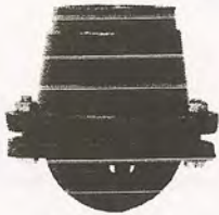
COMPLETE ASSEMBLY PAINTED