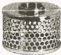
STANDARD THREADED ROUND HOLE TYPE *