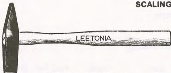
with handle inserted