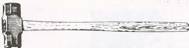
with handle inserted